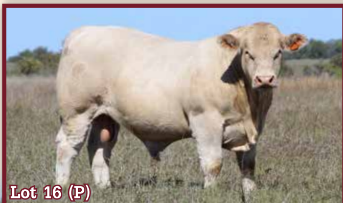
Lot 16 (P)