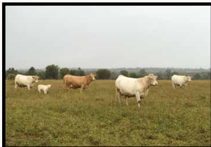
Pictured: Maiden heifers starting to calf after a beautiful wet July.

Comments: The Red Smoke bulls proved popular at our sale last year and we expect this bloke will be no different. Growthy and ready to work.