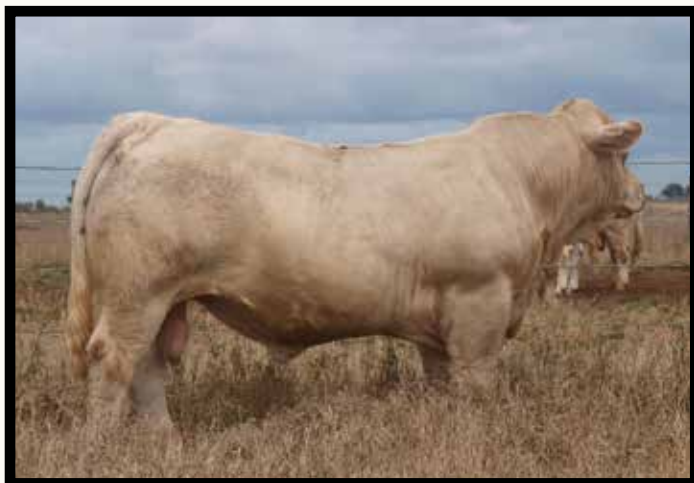
Pictured: Bauhinia Park Frosty (P) Sire of Lot 22, 29, 30 and 33.

Comments: Double polled - very functional bull with plenty of length and a good thick topline.