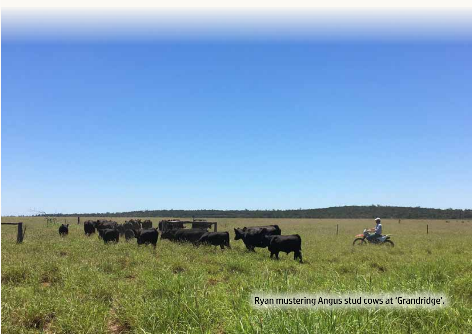
Ryan mustering Angus stud cows at 'Grandridge'.