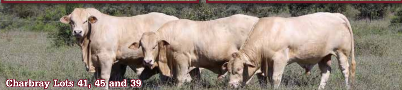
Charbray Lots 41, 45 and 39