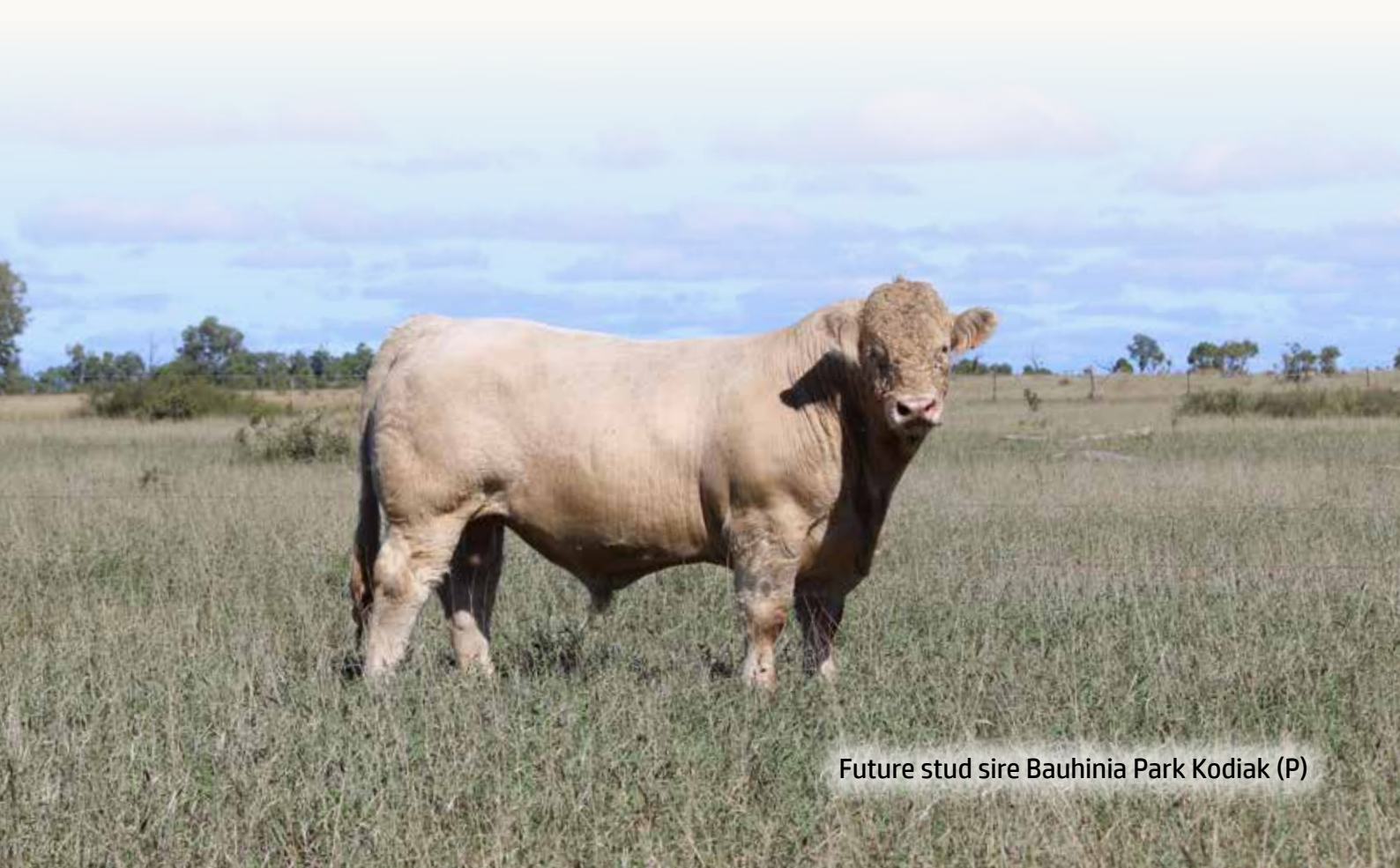
Future stud sire Bauhinia Park Kodiak (P)