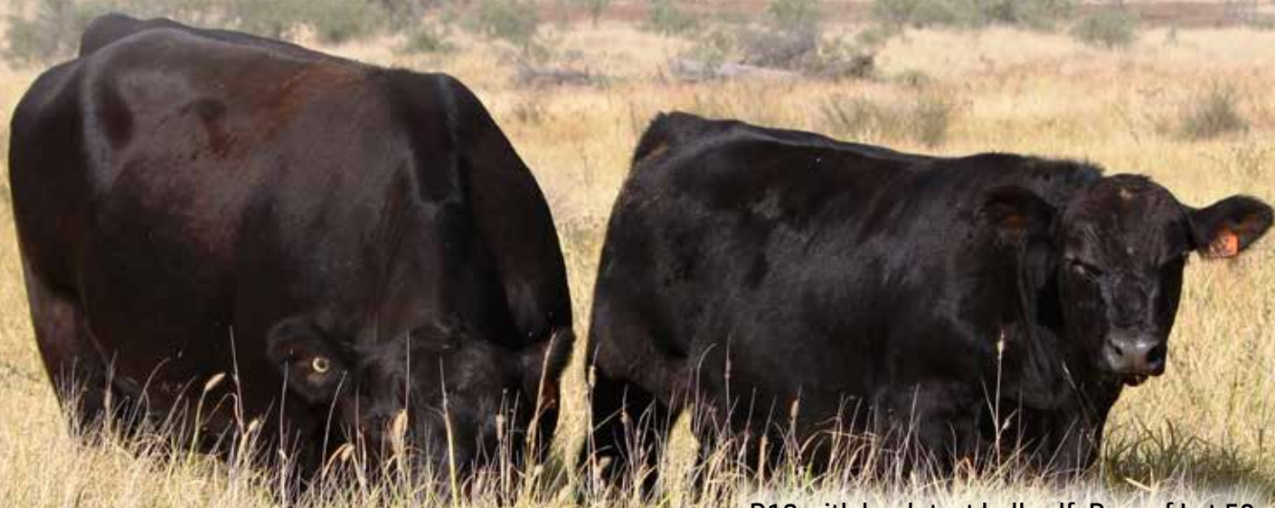
D18 with her latest bull calf. Dam of Lot 50.