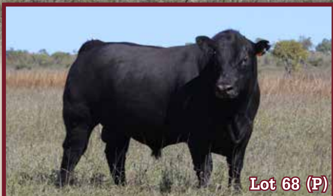
Lot 68 (P)