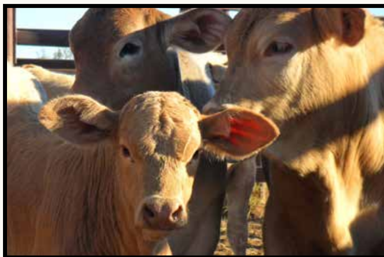
Pictured: Calves at 'Mulgrave' Barcaldine.

At this sale we offer 10 of these young Charbray sires. We hope you can appreciate them as much as we do, and confirm that they carry the same guarantee as all other Bauhinia Park bulls.