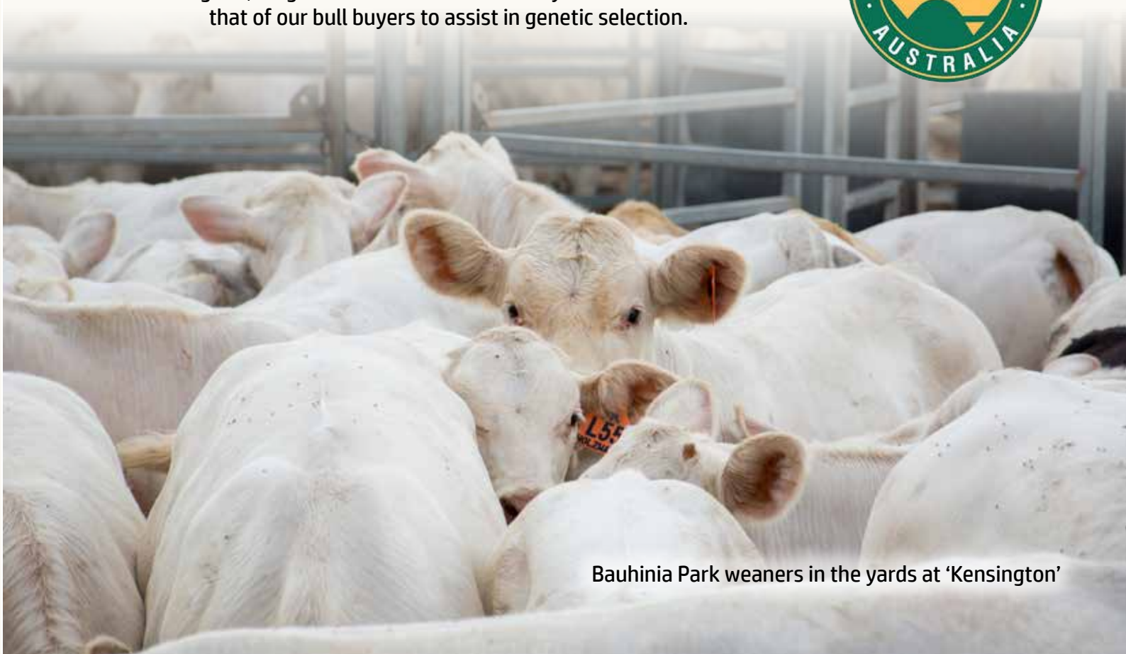
Bauhinia Park weaners in the yards at 'Kensington'