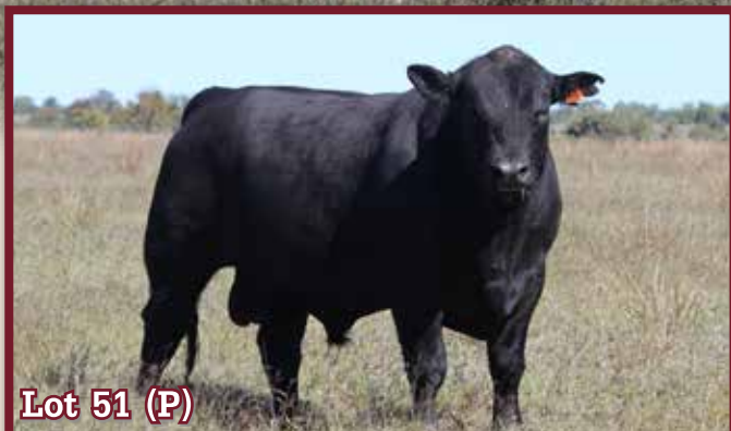
Lot 51 (P)