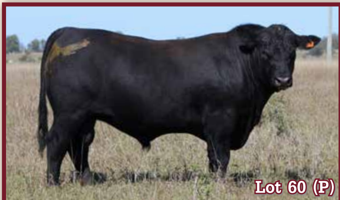
Lot 60 (P)