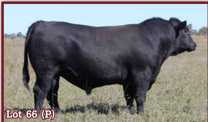
Lot 66 (P)